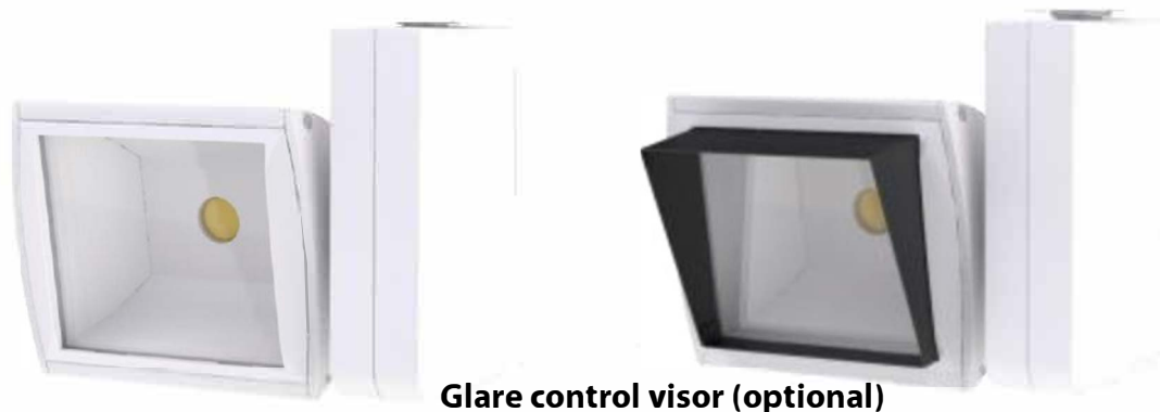
Glare control visor (optional)